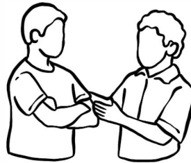
Talking with a Friend