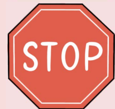
Standing Up Against Bullies