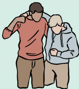
Being a Good Friend