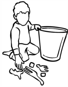
Cleaning Up Toys