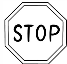
Standing Up Against Bullies