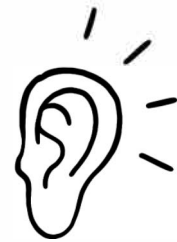
Listening to Your Teacher