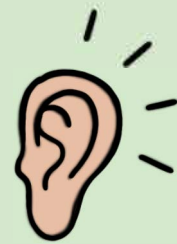
Listening to Your Teacher