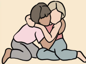
Giving Someone a Hug