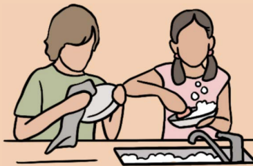
Helping Mom with Chores