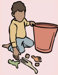
Cleaning Up Toys