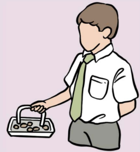
Taking the Sacrament