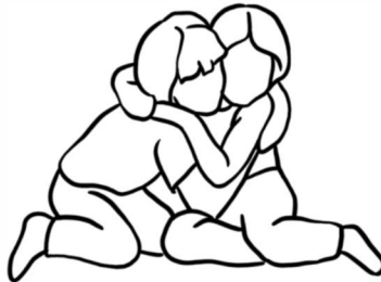
Giving Someone a Hug