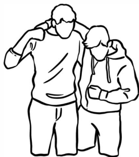
Being a Good Friend