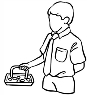
Taking the Sacrament