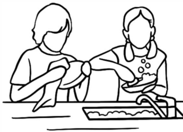
Helping Mom with Chores