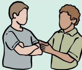
Talking with a Friend